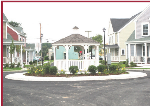
NEWPORT HEIGHTS - GAZEBO IN THE CENTER OF VETERAN'S CIRCLE