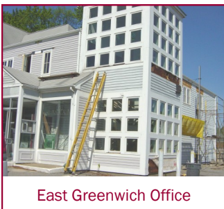
East Greenwich Office

The insurance offices on the second floor are ready for occupancy, the fire inspections have been completed and we are waiting for the certificate of occupancy. We have been awarded the fit-out of the first floor for the lawyers' offices. Design documents are being finalized so that this work can start immediately. The hazmat abatement will be done first, followed by selective demolition.