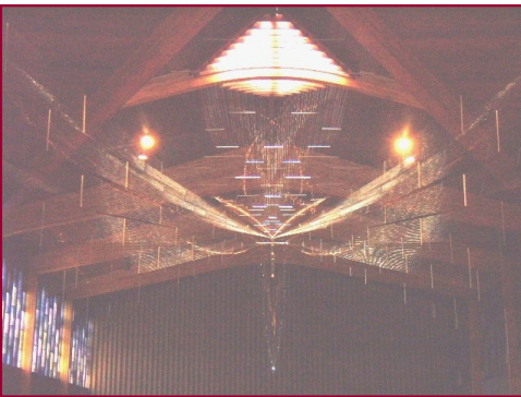
SHOWN LEFT: At St. Gregory the Great Church at the Portsmouth Abbey, the sculpture “The Trinity”, by Richard Lippold, is complete—the sculpture was restored and reinstalled by Newman Ltd. of Newport, RI.

This month in safety we are going to discuss the “do’s and don’ts” of electricity on the construction site. Electricity has become essential to modern life. Perhaps, because it is such a familiar part of our surroundings, and is often not treated with the respect it deserves. OSHA requires that employees not work near any part of an electrical power circuit, unless protected. Due to the dynamic, rugged nature of construction work, normal use of electrical equipment at the jobsite causes wear and tear that results in insulation breaks, short-circuits, and exposed wires. If there is no ground-fault protection, any of these instances can cause a ground-fault, that sends current through the worker's body, resulting in electrical burns, explosions, fire, and possibly death. The way to prevent a ground fault is to use ground-fault circuit interrupters on all 120-volt, single-phase, 15 and 20-ampere receptacles, and also visually inspect all electrical equipment before use. Remove from service any equipment with frayed cords, missing ground prongs or cracked tool casings. Everyone has been doing a very good job at all the jobsites with meeting all of the safety requirements. Keep up the good work and if there are any questions on safety please feel free to ask.