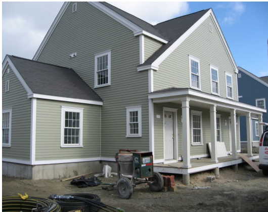
ABOVE: Newport Heights—Progress on Building #18,—this is the first building that will be completed—by Midd November, 2008. BELOW: Interior work on Building 18 is progressing.

Everyone has been doing a great job staying safe. Keep up the good work and stay warm!