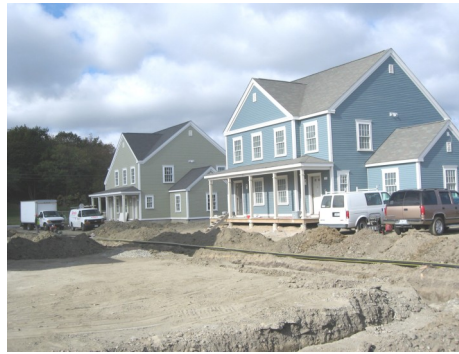
BELOW ON LEFT: Newport Heights—Building 18 and Building 19. ON RIGHT: Interior work on Building 18 continues.

Disclaimer: The opinions expressed above are those of the author and do not necessarily represent the opinions of Advanced Building Concepts. Under no circumstances does this article constitute advice. Please seek competent professional advice before making any decisions about your 401(k) account.